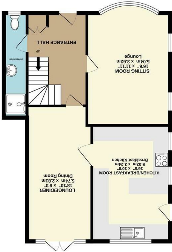
GROUND FLOOR 686 sq.ft. (63.7 sq.m.) approx.